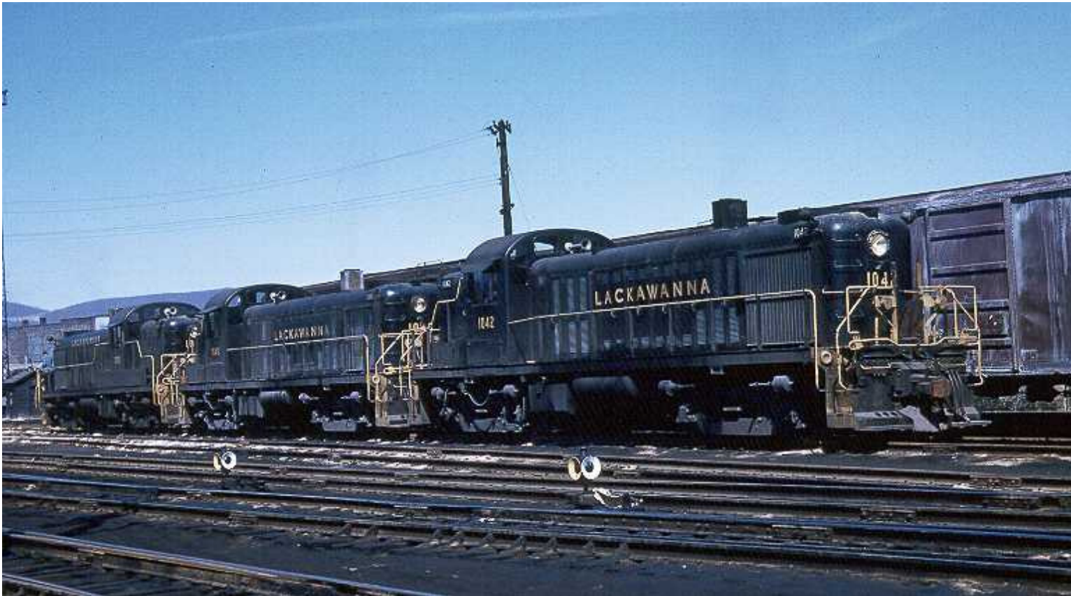
EL RS-3 1042 (Former DLW 904) - Scranton PA, 3/26/1961 {Larry Berger Collection} http://www.rr-fallenflags.org/el/loco/dlw1042.jpg

You should refer to photos from the time period you model to determine what paint scheme was in use at any given time on a particular locomotive. For example, DL&W RS-3 Alco's were delivered in an all black paint scheme but these locomotives were painted into different Erie Lackawanna paint schemes over the years. For instance DL&W RS-3 #904 was delivered in the standard DL&W switcher paint scheme of all black. It carried this paint scheme into the Erie Lackawanna as shown by the photo below.