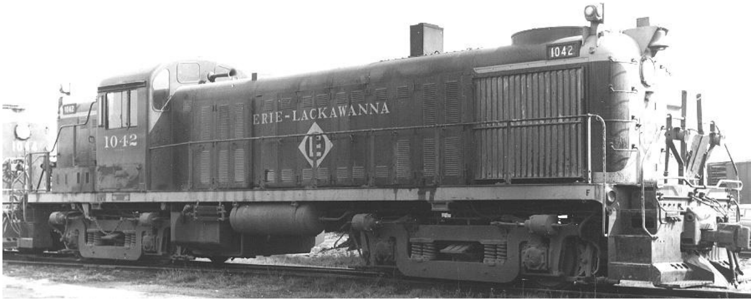
EL RS-3 1042 - Hammond IN - 8/12/1963 - {Larry Berger Collection} http://www.rr-fallenflags.org/el/loco/el1042alb.jpg

Later between 1961 and 1963 she was painted into the original EL paint scheme inspired by the Erie Railroad's paint scheme shown above.