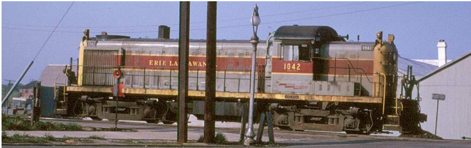
EL RS-3 1042 - Marion OH - circa 1966 to 1968 - {GPE Photo} http://www.rr-fallenflags.org/el/loco/el1042age.jpg

Later between 1961 and 1963 she was painted into the original EL paint scheme inspired by the Erie Railroad's paint scheme shown above.